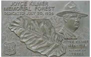
Joyce Kilmer Memorial Loop Trails

WARNING: The Jenkins Meadow Trail, Naked Ground Trail and Stratton Bald Trail lead to remote areas. It is highly recommended to have detailed Forest Service maps and GPS when hiking these trails.